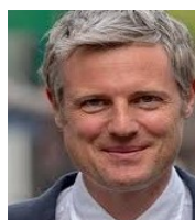
Zac Goldsmith Conservative