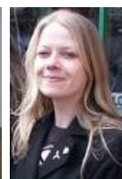
Siân Berry Greens