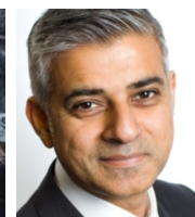
Sadiq Khan Labour

Peter Whittle—UKIP and a number of independent candidates are also standing for election